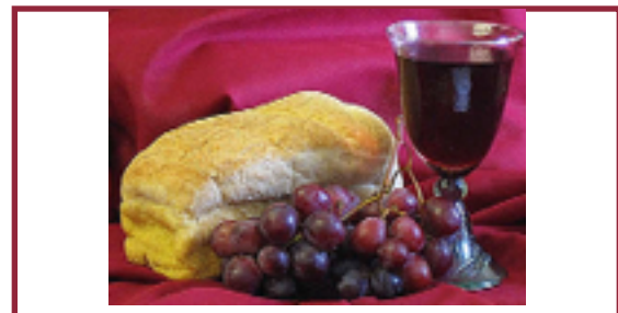
Silent Lord's Supper December 24, 6:00 PM

See Crystal if you are interested in going. $100 Deposit due by January 8, 2017